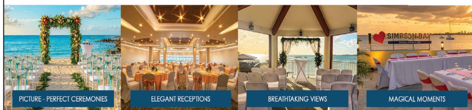
PICTURE - PERFECT CEREMONIES